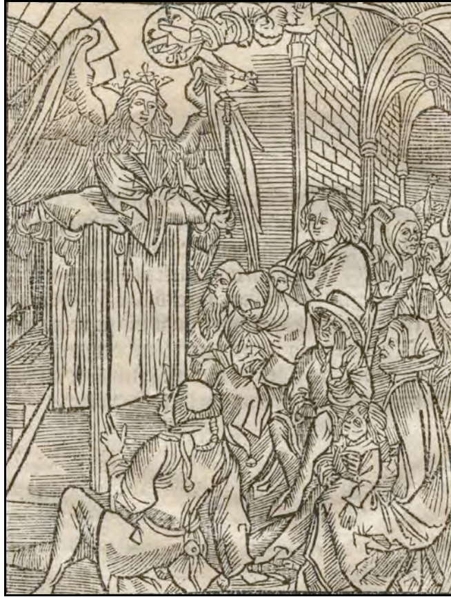
Witchcraft. No. 6.

Tel. (610) 660-0132 info@mckittrickrarebooks.com (610) 660-0133 Fax